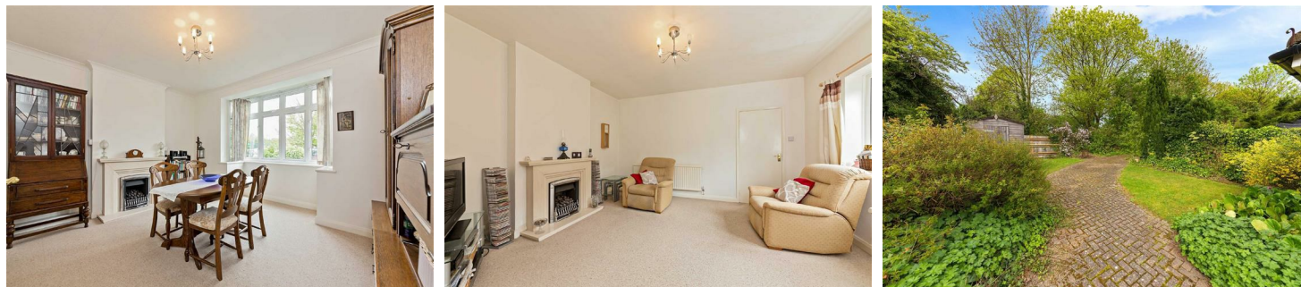
Ground Floor Approx. 69.1 sq. metres (743.4 sq. feet)

Conveniently situated within approximately one mile of St Albans mainline railway station is this deceptively spacious three bedroom detached home. The property provides generous and attractively presented accommodation which offers versatility to suit any potential family. Boasting features to include two light filled reception rooms both with fire places, makes for a welcoming atmosphere and to the rear of the property a useful study/family room/bedroom four. Also to the ground floor is a modern fitted kitchen and a cloakroom. Upstairs are three bedrooms and a family bathroom. To the front, a driveway providing off road parking, whilst also giving access to a plot of one third acre extending behind the other houses in the road (refer to agents note). To the rear is a low maintenance garden which offers the scope to extend (stpp) if desired. Campfield Road is situated close to excellent schools, good local shopping amenities and the mainline railway station.